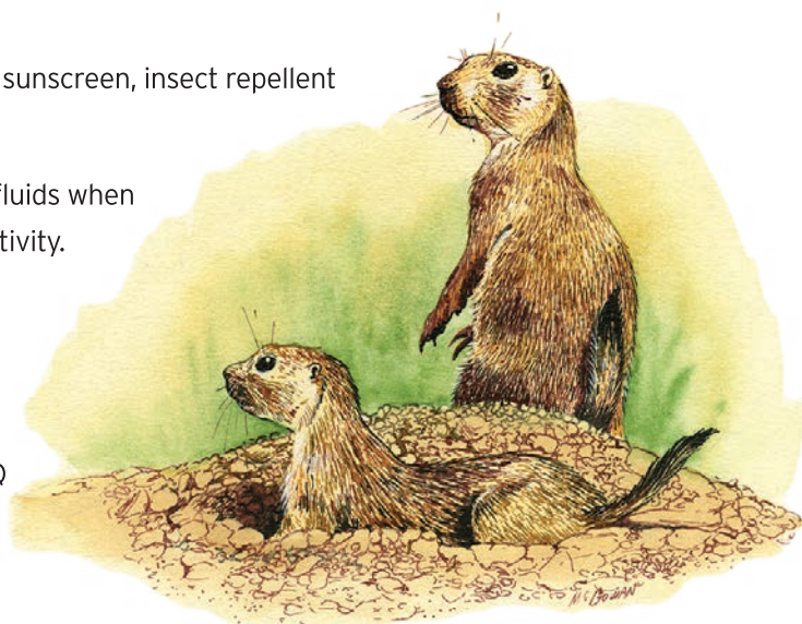
Black-tailed Prairie Dog

DO NOT APPROACH BISON. Bison are wild. Stay at least 50 yards away. Never surround, crowd, approach, or follow bison or any other park wildlife.